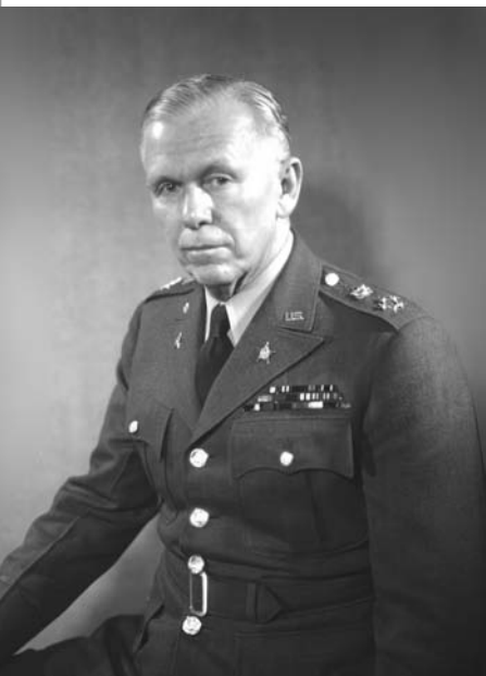
General of the Army George C. Marshall, 1880–1959